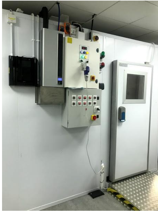
Figure 2: Test Chamber Exterior

The bio-aerosol was generated using a 24-jet Collison nebuliser operated with a purified filtered air supply.