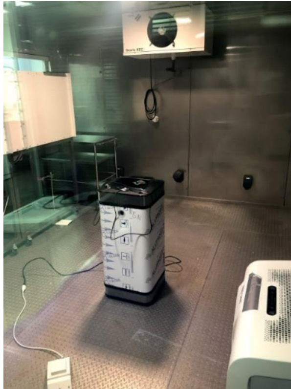
Figure 1: NV340 P4 US Medical device in Test Chamber