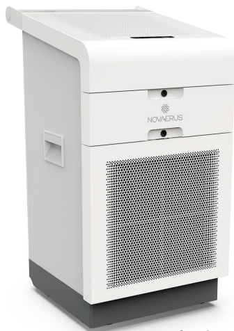
Defend 1050 Air Cleaning Device