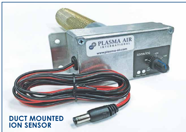
DUCT MOUNTED ION SENSOR

The Plasma Air Duct Mounted Ion Sensor is designed to sense the presence of ions in a duct. Dry contacts are provided to interface with the Building Automation System (BAS). The contact will open below a user-defined value and will close above that value. The sensor also includes LEDs for power and ion indication. The unit is installed on the side of the duct utilizing the pre-drilled mounting brackets located at either side of the unit with the probe extending into the airstream. The unit contains a control knob that can be field adjusted to increase or decrease the sensitivity at which the ions are sensed.